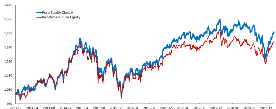
Performance (in base currency, indexed at 1000)