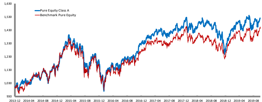
Performance (in base currency, indexed at 1000)